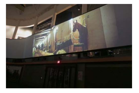
In the museum we watched a 360 degree wrap around video presentation of the life of a race horse.

On Wednesday we woke up early and bused over to tone of the star attractions of Louisville, and even the state of Kentucky; Churchill Downs Racetrack, home of the Kentucky Derby. We toured the museum, which was fabulous, and got to watch some race hours work out for their morning exercise.